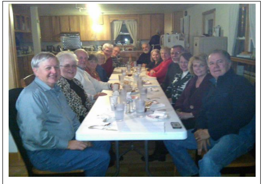
Bible 101 enjoying fellowship together after their last class.